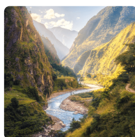
Misty Mountain, Winding River