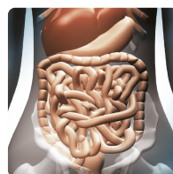
Burps, Bottoms and Bile